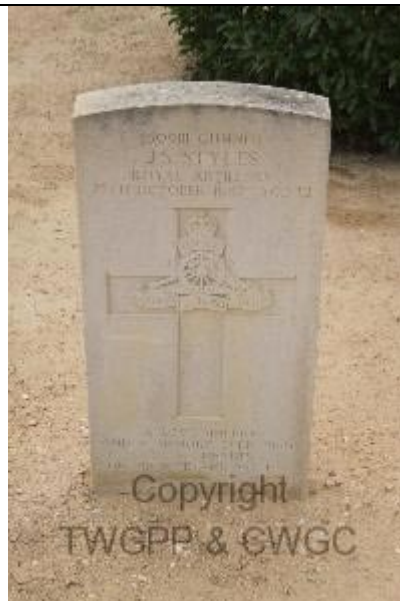
Stephen Styles' grave in El Alamein War Cemetery