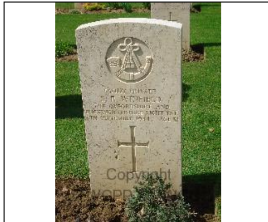
Stanley Winfield's grave in Coriano Ridge War Cemetery, Italy

new offensive in France, and the Germans dug in to a number of key defensive positions, the advance stalled as winter set in. Coriano Ridge was the last important ridge in the way of the Allied advance in the Adriatic sector in the autumn of 1944. Its capture was the key to Rimini and eventually to the River Po. German parachute and panzer troops, aided by bad weather, resisted all attacks on their positions between 4 and 12 September 1944. On the night of 12 September the Eighth Army reopened its attack on the Ridge, with the 1st British and 5th Canadian Armoured Divisions. This attack was successful in taking the Ridge, but marked the beginning of a week of the heaviest fighting experienced since Monte Cassino in May, with daily losses for the Eighth Army of some 150 killed.