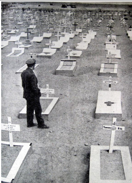
Tobruk military cemetery in 1942, before the fall of the town to Axis forces