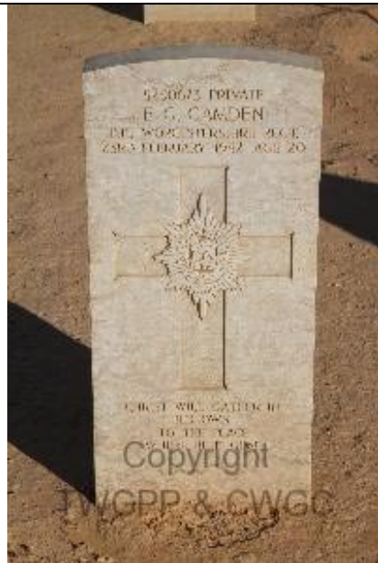
Eric Camden's grave in Tobruk War Cemetery