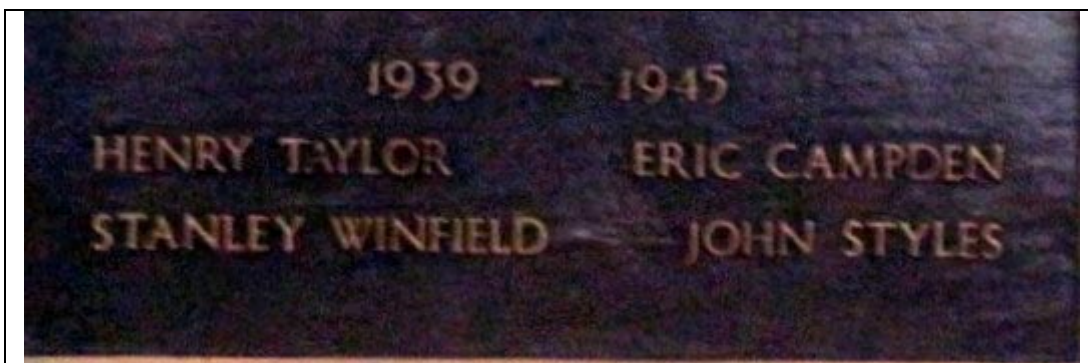
Section of War Memorial plaque in Wickhamford Village Hall

Acknowledgement: We are grateful to family members who have kindly supplied photographs.