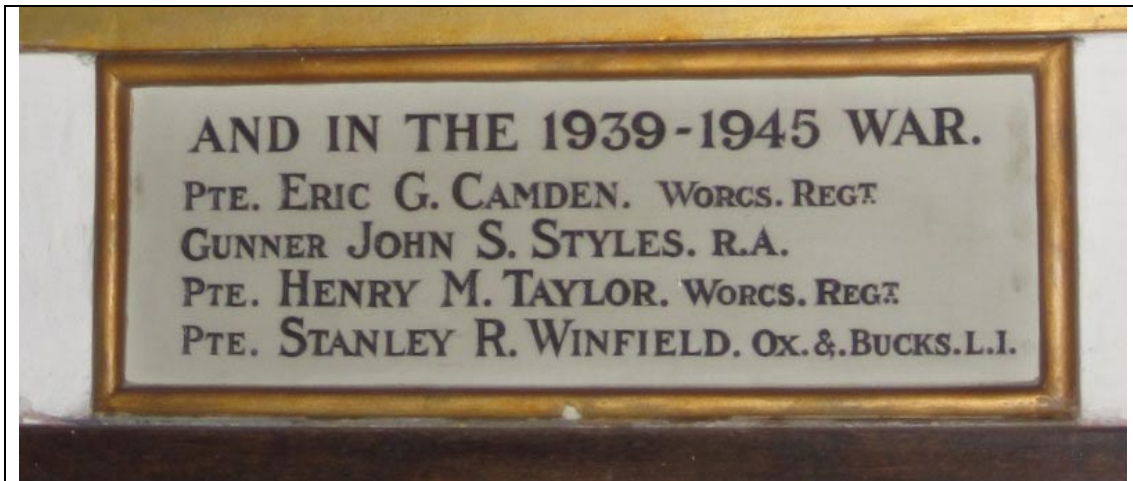
Tablet in Wickhamford Church to the soldiers who died in World War II

The names of four soldiers who died in World War II are recorded on the War Memorials in Wickhamford Church and the Village Hall. The military records of these men are not freely available apart from the information given by the Commonwealth War Graves Commission. The following details concern their locations when they died and some historical context to events leading up to their deaths. An outline of their family background is also given.