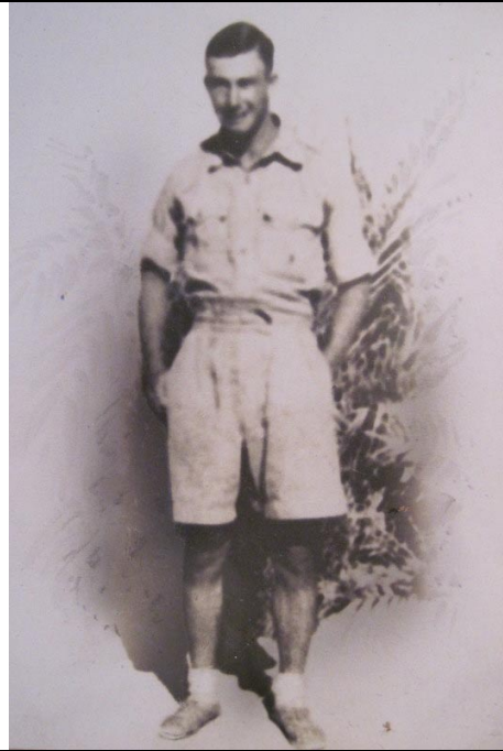
Eric Camden in desert uniform